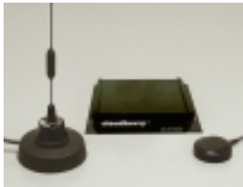
Start with TerraTrak™ Terrestrial GPS/AVL Tracking System