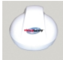
Add a Cloudberry SatCom Terminal for DualTrak+™ with Dual-Mode Tracking and Messaging